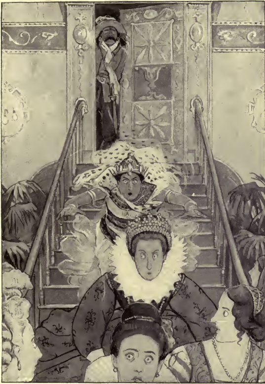
“ THE HARD FEATURES OF KIDD WERE THRUST THROUGH ”